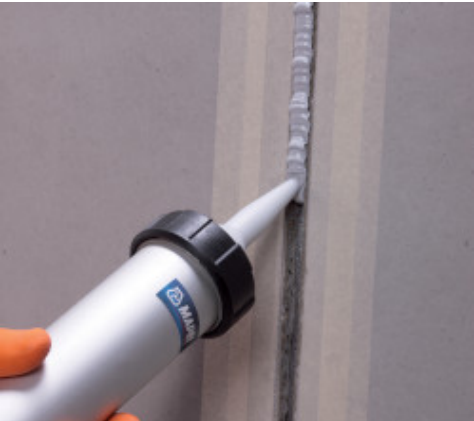
Application of Mapeflex PU40