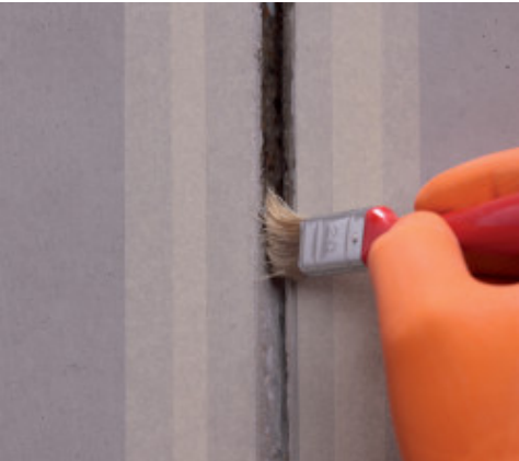
Application of Primer M or Primer A

Use specific manual caulking guns for 300 ml cartridges or 600 ml soft cartridges from Mapei Gun range. Extrude the sealant into the joint in a continuous flow without entraining air. Immediately after applying the product smooth over the surface with a suitable tool kept constantly wet with soapy water.