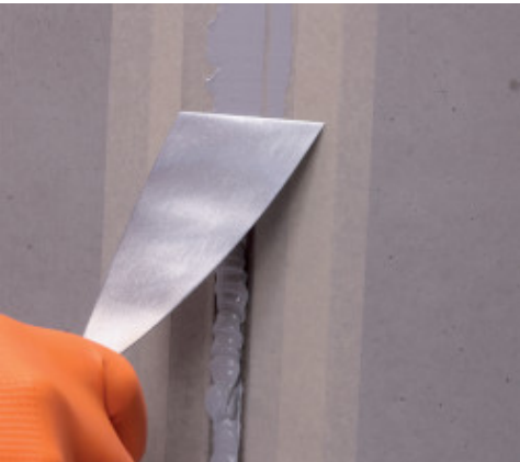
Smoothing over Mapeflex PU40