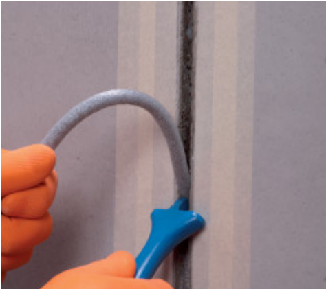
Inserting Mapefoam inside the joint