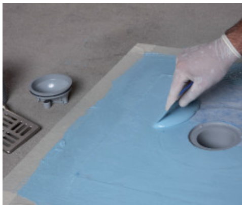
Impregnating Drain Vertical fabric with Mapelastc AquaDefense