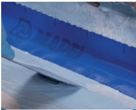
Application of Mapeband on a wall-floor fillet joint with Mapelastc AquaDefense