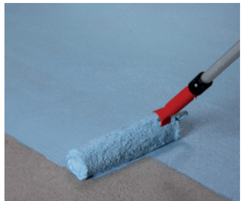
Application of the first coat of Mapelastc AquaDefense on a screed