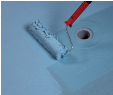
Application by roller of Mapelastc AquaDefense second coat